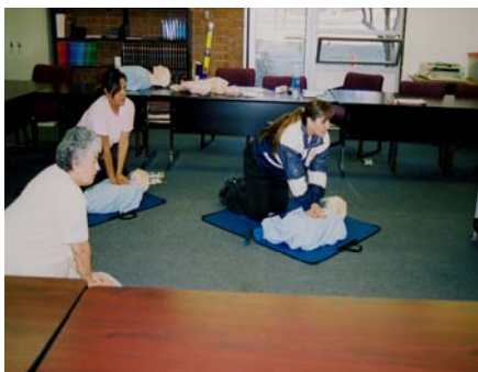
2006 First Aid & CPR in Learning Lab

Participants also receive a participant's workbook and laminated skills card that include full-color images and easy-to-read text that will walk you step by step through a variety of lifesaving skills. The skills card will also serve as an excellent refresher and reference tool after training is complete.