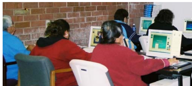
2006 Computer Course 101 evening class.